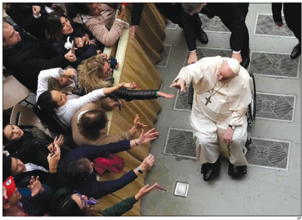
Pope Francis leaving at the end of his weekly general audience in the Paul VI Hall at the Vatican, on Wednesday.