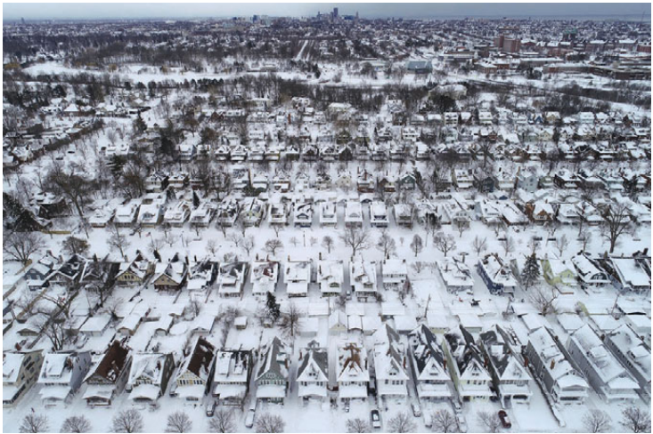
An aerial view of the 1901 Pan-American Exposition neighbourhood after a blizzard in Buffalo, on Tuesday.

Even in central Florida, temperatures plunged as low as 27 degrees (minus 2.7 Celsius) over the weekend. Growers' groups were relieved yesterday not to find widespread damage to the fruit and vegetable crops that supply much of the US with fresh winter produce.